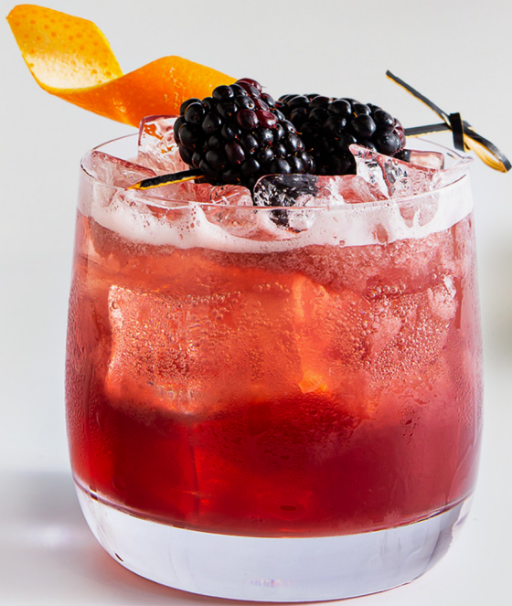
JAM GIN FIZZ