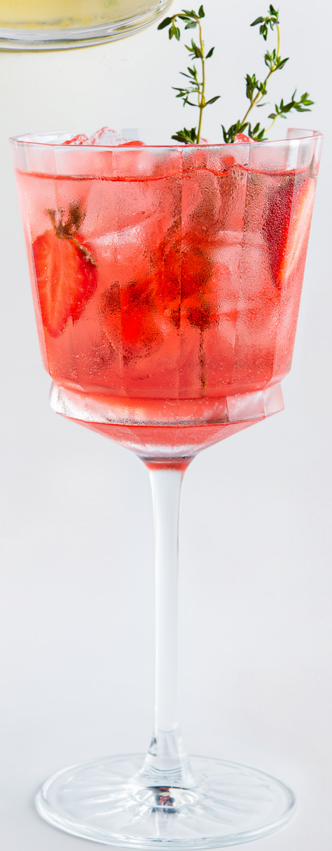
SINK WITH THE PINK