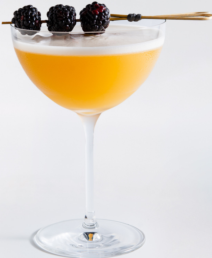
CATCH ME IF YOU CAN